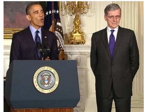
President Barack Obama announcing his nomination of Tom Wheeler to chair the FCC.