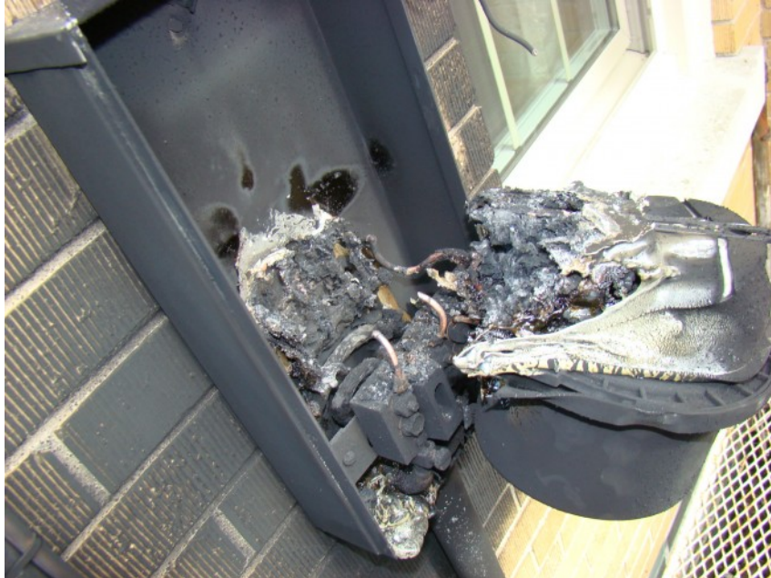
A General Electric smart meter after it burst into flames at a home in Illinois.

http://www.wired.com/threatlevel/2012/09/self-combusting-smart-meters/