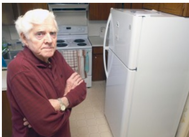
Fridge blows after smart meter installed